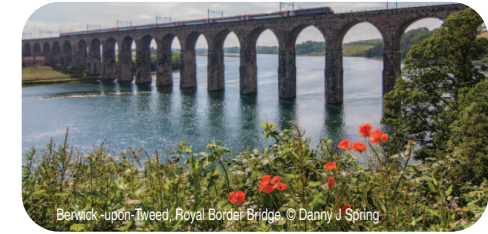
Berwick-upon-Tweed, Royal Border Bridge.