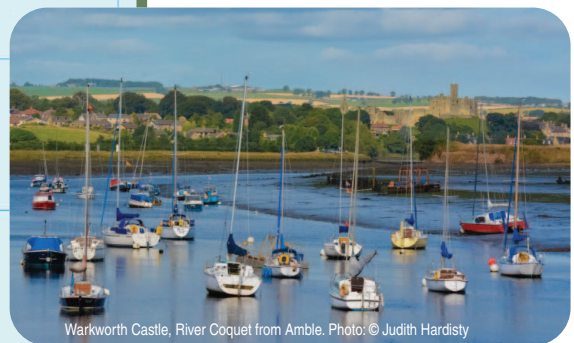
Warkworth Castle, River Coquet from Amble. Photo: © Judith Hardisty

Cycle map: Scale 1:50 000 - 2cm to 1km - 1 1/4 inches to 1 mile based on Ordnance Survey 1:50 000 scale mapping.